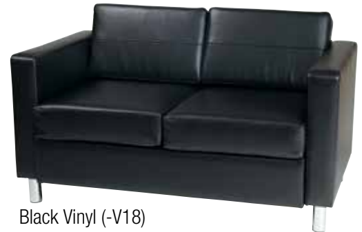
Black Vinyl (-V18)