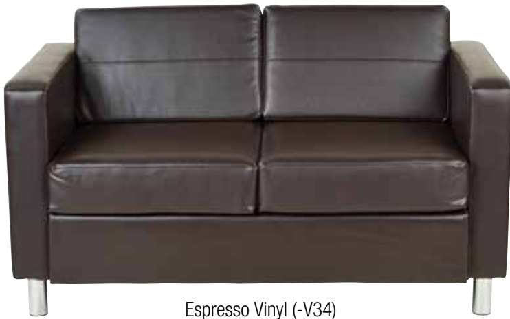
Espresso Vinyl (-V34)