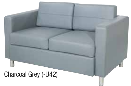
Charcoal Grey (-U42)