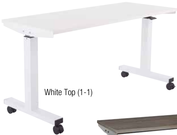
White Top (1-1)