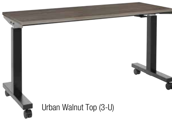
Urban Walnut Top (3-U)