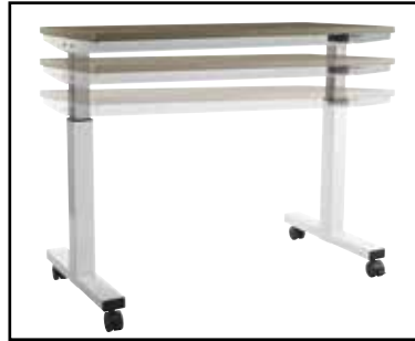
Adjustable Height: 30.25~43.25"